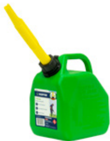
PART NO. 95-8454