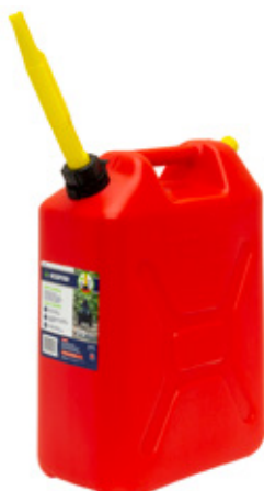
PART NO. 95-8463