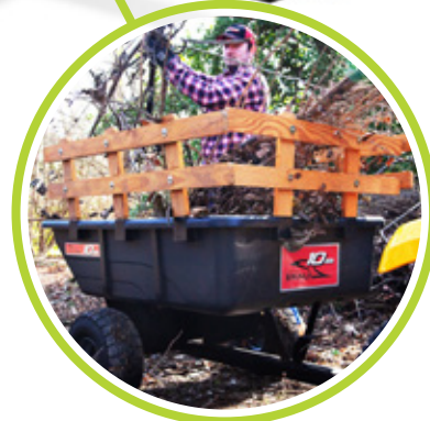
STAKE SIDE KIT FITTED