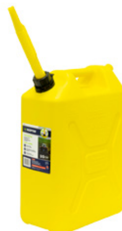
PART NO. 95-8461