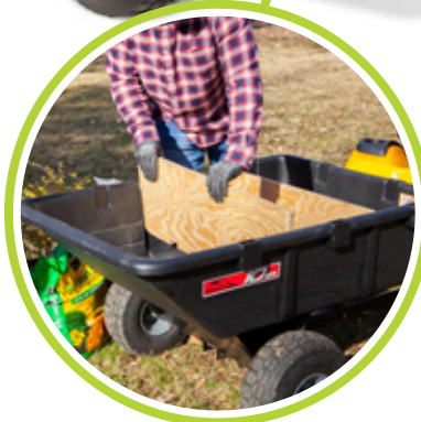
BED DIVIDER CHANNELS FITTED