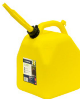
PART NO. 95-84608