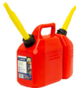
PART NO. 95-8455