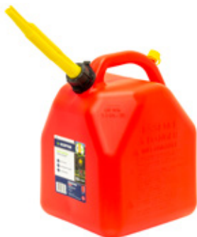
PART NO. 95-8462