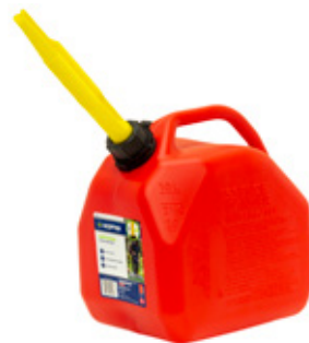
PART NO. 95-8460