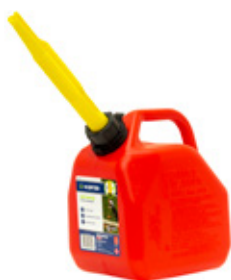
PART NO. 95-8453